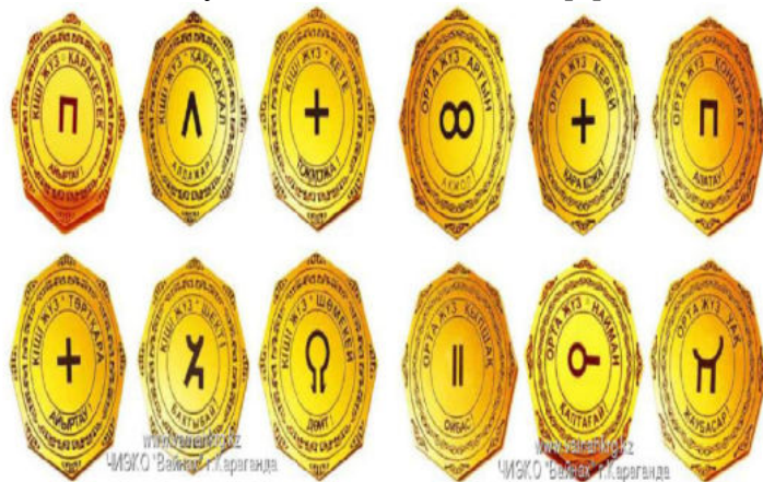
Picture 2. The signs of the Middle and Junior zhuzes

of the Aral sea. It consists of the union of tribes - Alimuly (karakesek, karasakal, kete, tortkara, chomekey, shekti); Baiuly (adaya, alshyn, zhappas, alasha, baybakty, berish, esentemir, kyzylkurt, sherkesh, ysyk, taz, maskar); Zhetiru (tabyn, tama, kerderi, zhagalbayly, kereit, toleu, ramadan). The date of formation of zhuzes and the way of their organization have not yet been studied in detail [5].