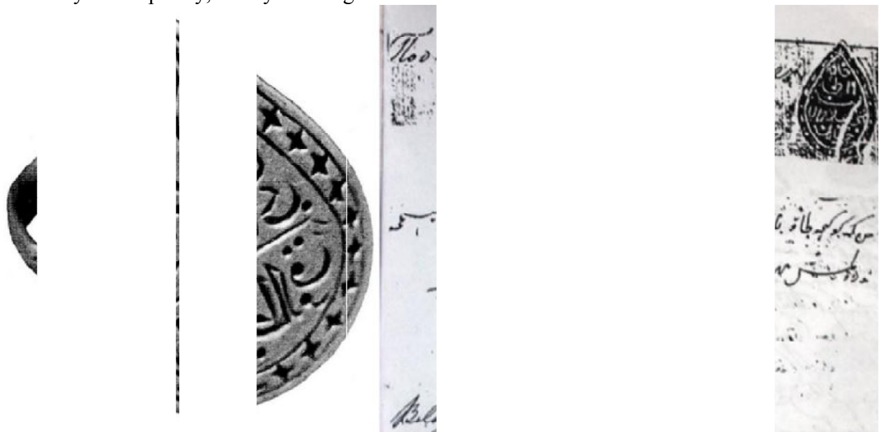
Picture1. Image of ring-shaped seals used by representatives of the kazakh ruling elite

As noted above, one of the main attributes of the the Kazakh khanate's statehood for four centuries was the applied seals of kazakh khans and sultans. They were used to certify various internal political documents and international treaties. This is a manifestation of the sovereignty, independence of the state. The study of many documentary sources of that time, as well as familiarization with relics of famous kazakh sultans of the late XVIII-early XIX centuries with the names of some of his modern descendants, gives reason to argue that the personal seals of the kazakh elite were mainly in the form of metal rings. The seal in the form of rings was distinguished by its simplicity, clarity and elegance.