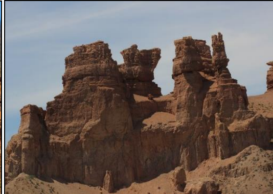
Figure 4. Moyyntokay Valley with canyons