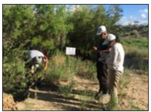
Figure 6. Study of Grove ash Sogdian

Viability: full viability, (plants have normal growth) full bloom; grows in common clusters.