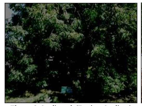
Figura 8. Sogdian ash (Fraxinus Sogdiana)