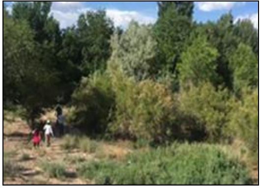
Figure 7. Natural boundary Sarytogay