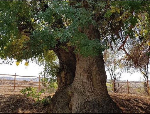
Figura 9. Turanga poplar, age 400 years