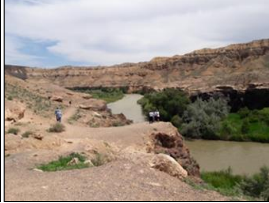
Figure 3. Kurtogay hilly-inclined plain with deep ravine

From the east, to the right side of the tract Kurtogay adjoins a site with an extremely dissected relief. Numerous gullies and ravines, wriggling, intersecting and newly