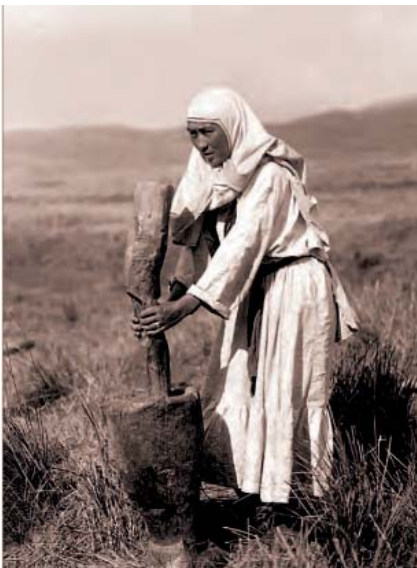
Fig. 5. “Millet grinding on the Nura River”. Central Kazakhstan. Late XIX century. From (Rezvan 2016).

As for the distribution of millet in Kazakhstan, it can be noted that isotopic data from previous studies demonstrated its consumption in the south-eastern regions of Kazakhstan from about the 18 th c. BC (Motuzaite Matuzeviciute et al, 2015), and in Central Kazakhstan