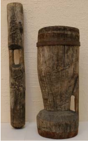
Fig. 4. Keli, Kazakh tool for grinding millet. From the collection of the Karaganda Historical Museum.

Рис. 4. Кели, казахский инструмент для измельчения проса. Из фондов Карагандинского исторического музея.