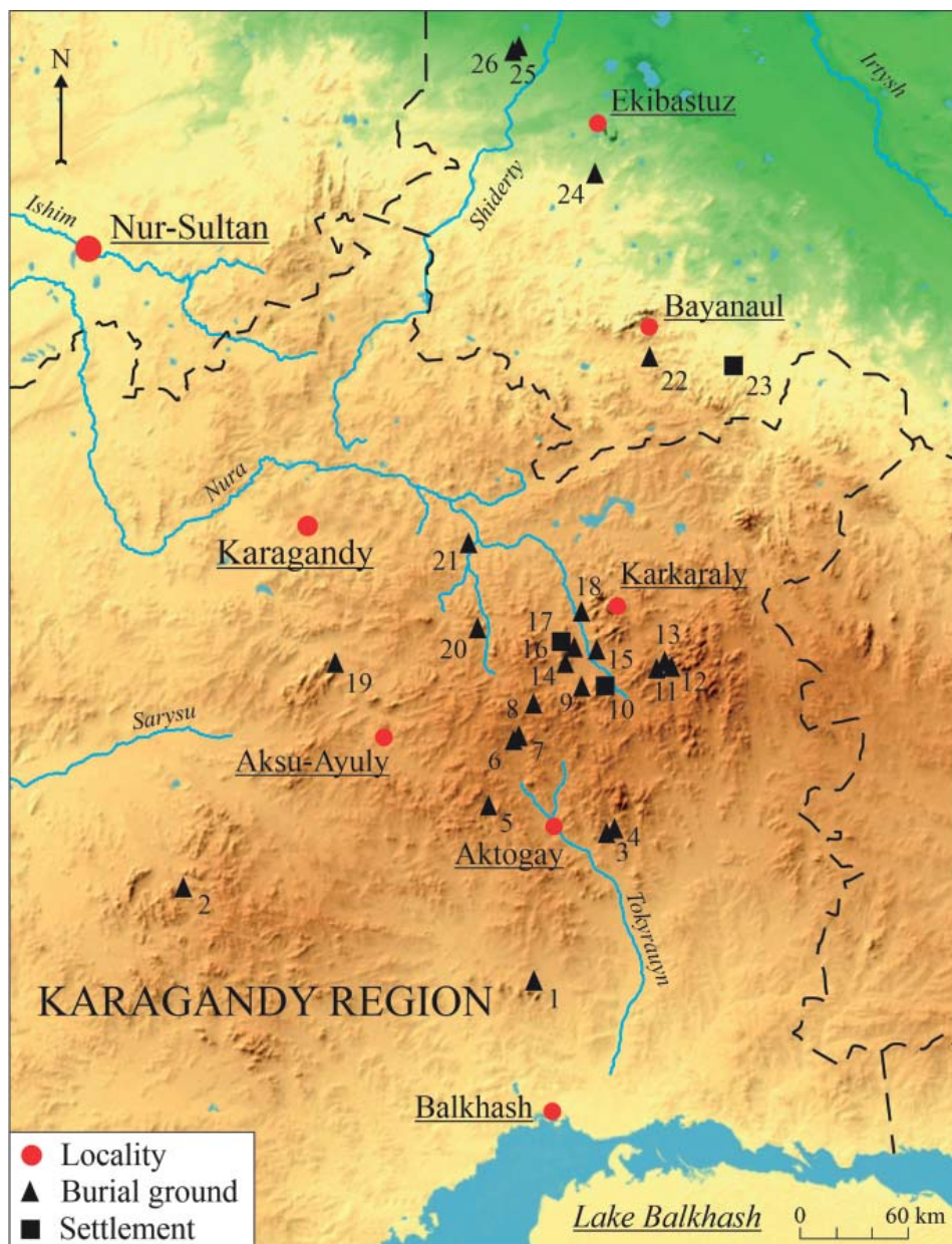
Fig. 1. Location map of the analyzed sites. 1 – Bektauata; 2 – Koishoky-5; 3 – Begazy; 4 – Kyzyl; 5 – "37 warriors"; 6 – Karashoky; 7 – Karashoky-6; 8 – Akbeit; 9 – Bakibulak; 10 – Sarybuirat; 11 – Koitas; 12 – Taisoigan; 13 – Taldy-2; 14 – Nurken-2; 15 – Nazar-2; 16 – Kabakshi; 17 – Abylai; 18 – Kosoba; 19 – Kizilkoi; 20 – Zhamantas; 21 – Tandaily-2; 22 – Kyzykshilik; 23 – Tagibaibulak; 24 – Birlik; 25 – Tortyi, 8; 26 – Tortyi-3.

Рис. 1. Карта расположения проанализированных памятников. 1 – Бектауата; 2 – Койшоки-5; 3 – Бегазы; 4 – Кызыл; 5 – "37 воинов"; 6 – Карашоки; 7 – Карашоки-6; 8 – Акbeit; 9 – Бакыбулак; 10 – Сарыбуйрат; 11 – Койтас; 12 – Тайсойган; 13 – Талды-2; 14 – Нуркен-2; 15 – Назар 2; 16 – Кабакши; 17 – Абылай; 18 – Кособа; 19 – Кызылкой; 20 – Жамантас; 21 – Тандайлы-2; 22 – Кызылшилик; 23 – Тагыбайбулак; 24 – Бирлик; 25 – Тортуй, 8; 26 – Тортуй-3.