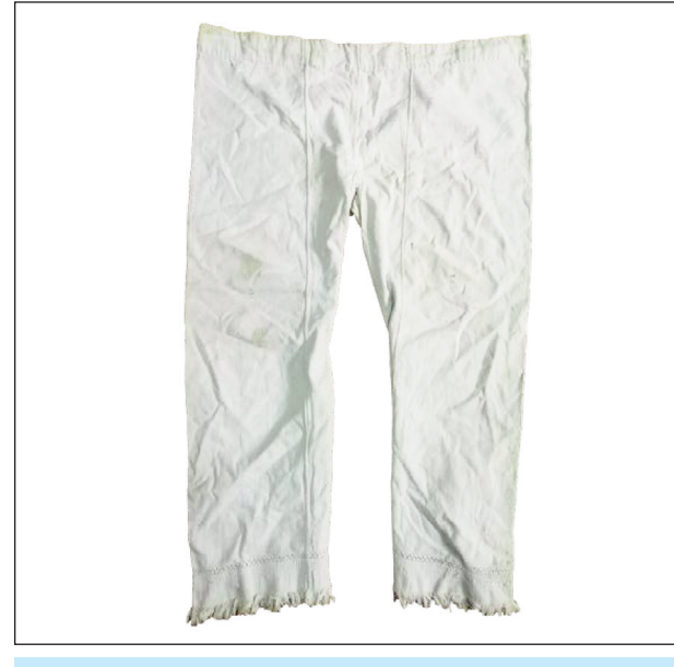
Fig. 1. The traditional Romanian trousers from which the samples were taken

In order to carry out the study, it was considered the analysis of samples of materials taken from a traditional Romanian trousers called "gatii" (leggings) from the Maramures area (figure 1), made from cotton, which is one of the main materials the Romanian traditional folk costumes are mainly made of. The value of the piece is given by the conventional way it was produced (in the loom) and by its age, dating from the first half of the last century.