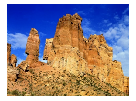
Figure 4. The Red Canyon of Sharyn.

The vegetation cover of this site is represented by sparse xerophytic-cereal-shrub vegetation on alluvial meadow soils. The vegetation cover of the geobotanical site is formed by Astragalus Sharynsky, Libanotis iliensis, Populus pruinosa, and Kolpakovsky tulip [13, 14]. In some areas, design coverage can reach 55%.