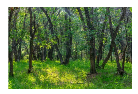
Figure 1. Natural boundary Sarytogay.