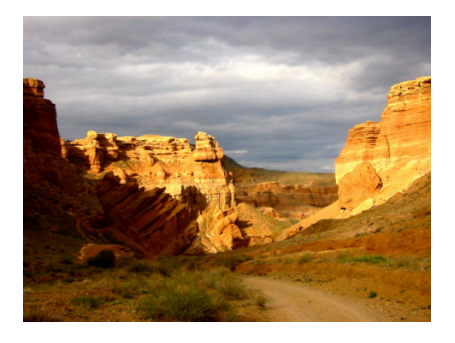
Figure 3. Moyntukay Valley with Canyons.

The critical area No. 2, the Moyyntokay Valley (43^{\circ}24.231/N; 79^{\circ}10.218/E) , is located 1,121 m above sea level. Sharyn canyons in the tract of Moyyntokay (figure 3) with morphological sculptures (figure 4) are found from the Sharyn River's exit from the gorge to the mouth of Temirlik. Streams cut canyons and narrow valleys into sedimentary rocks aged about 12 million years. The height of the steep walls of the canyons reaches 150–300 m. Some canyons are oriented perpendicular to the strike of the Sharyn River valley. The length of one of the most picturesque canyons, the Red Canyon, is about 3 km, a width -20-130 m, a depth -100-200 m [6].