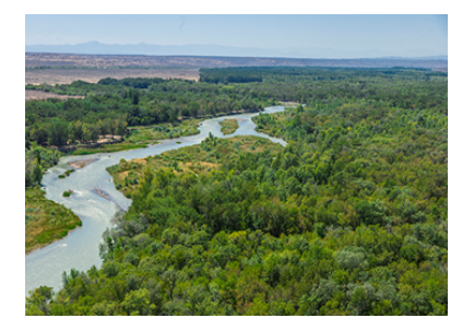
Figure 2. Relict Grove ash Sogdian.

The critical area No. 2, the Moyyntokay Valley (43^{\circ}24.231/N; 79^{\circ}10.218/E) , is located 1,121 m above sea level. Sharyn canyons in the tract of Moyyntokay (figure 3) with morphological sculptures (figure 4) are found from the Sharyn River's exit from the gorge to the mouth of Temirlik. Streams cut canyons and narrow valleys into sedimentary rocks aged about 12 million years. The height of the steep walls of the canyons reaches 150–300 m. Some canyons are oriented perpendicular to the strike of the Sharyn River valley. The length of one of the most picturesque canyons, the Red Canyon, is about 3 km, a width -20-130 m, a depth -100-200 m [6].