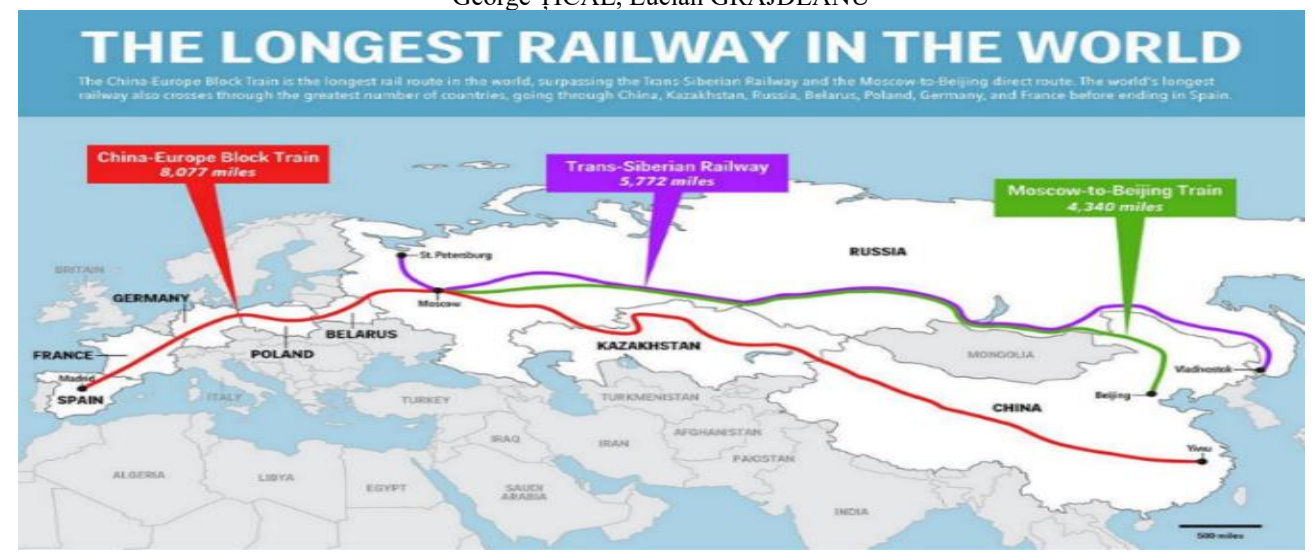
Fig. 2: The China-Europe Block Train