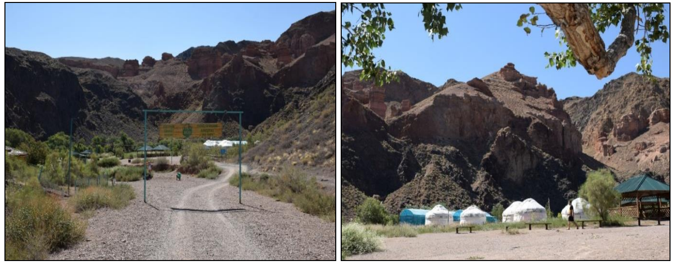
Figure 10. The camping area on the Charyn riverbank

appear in the floodplain. There are many remnants of ancient fauna. It is in this section of the valley that the remains of ancient elephant, primitive horse, antelope, bull and other large and small animals were collected and studied for the first time; the remains of ostrich shells were found. The valley is cut into sediments of the Ili and Khorgos Formations, composed of clays, loams, lenses of sandstone and fine pebbles. In the valley, Quaternary sediments formed a floodplain, the first and second terraces above the floodplain. The sides of the valley cut through numerous dry valleys and ravines. The floodplain and its terraces are composed of clays, loams, layers of sand with gravel and pebble (Kostenko, 1978). Alluvial cones of dry valleys can be seen everywhere in the valley's sides.