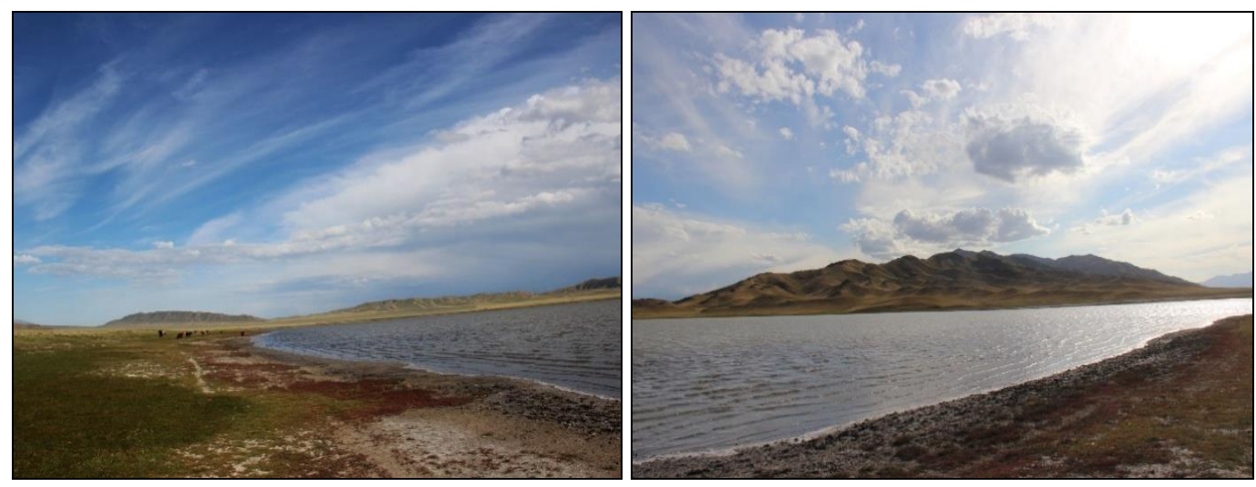
A. North side

They are the highest ones in our region. The lake is unusually salty, the most salty in the mountains of Kazakhstan. Its salinity is extremely variable depending on the water inflow. It can reach 225 g/l, that is, almost the same as in the Dead Sea of the Arabian Peninsula. The salt deposition is continued in the lake; in the past, the salt was extracted and carried to the surrounding villages and even to the Issyk-kul region. The shoreline Tuzkol muds have curative properties (Figure 12).