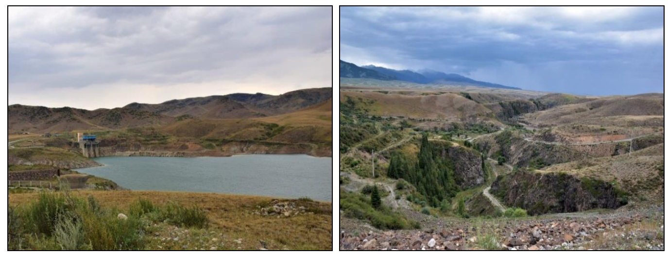
A) Bestyube reservoir

Down the Shet Merke estuary, the Charyn River overlooks the expanse of the intermountain Zhalanash depression (Figure 4 (A, B). It cuts into the Cenozoic loose clastic thickness 150-200 m deep. It consists mainly of the Neogene proluvial alluviation interlaid with lacustrine sediments. The Neogene thickness is covered by alluvial (riverine) Lower Quaternary sediments of boulders and gravels. The largest boulders reach 0.5 m in diameter. Lower Quaternary conglomerates from the surface are overlapped by loess of the same age (Tyut'kova, 1988; Aubekerov at al., 1990). The Cenozoic sediments of the Zhalanash depression contain numerous remains of ancient animals, among which notable are rodents, bones of ancient elephant, horse and antelope (Kozhamkulova et al., 1978; Bayshashov, 2005). The bone remains were first discovered here in 1977 by the team of the Paleozoology Laboratory at the Institute of Zoology (Almaty, Kazakhstan). This location is also known in literature as Kopaly or Aktogai (Figure 5, 6). In 1990, a group of geologists and palaeontologists analysed and described the site section using known palaeontological and geological data (Aubekerov at al., 1990).