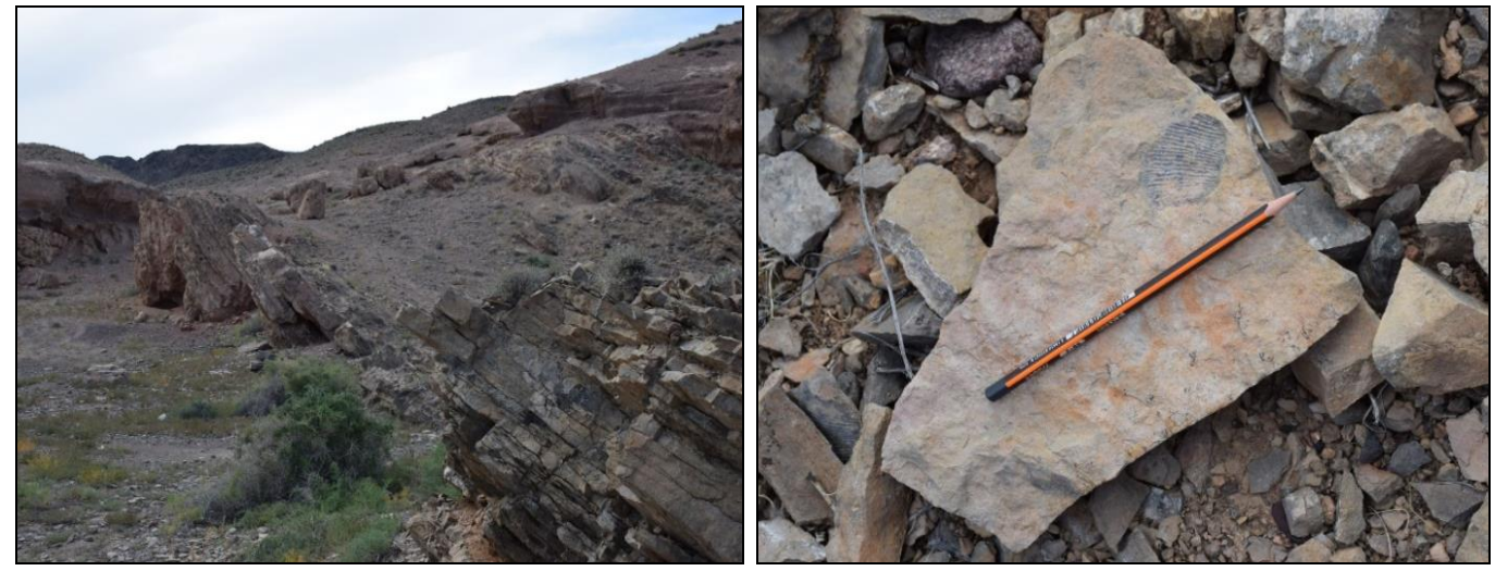
A. General view of Paleozoic limestone of Charyn region Figure 8. Paleozoic limestone with brachiopod shells of Charyn canyon B. Paleozoic limestone with brachiopod shells of Charyn canyon

material into the Zhalanash depression and form the abovementioned conglomerates. The downstream Kurtogai gorge changed dramatically: the river leaves the Zhalanash depression and crashes into the eastern spur of the Toraigyr range. Here it flows in a wild rocky gorge 300 m deep. Paleozoic (Carboniferous) volcanic rocks are exposed along the slopes, and the gorge bottom is fully filled by the water current. At the point where the river enters the Toraigyr rocky massif, the contact of Paleozoic rocks with the Cenozoic loose clastic thickness is clearly visible on the right side of the canyon. The tectonic structure is impressive: the rock block rises above the Cenozoic sediments, horizontal layers of which bend upwards at the contact, indicating the active rise of the Toraigyr. In Toraigyr, the rocky gorge stretches for about 8 km. From there, Charyn enters the expanses of the Ili depression and again cuts deep into the Cenozoic and Paleozoic deposits. Here is another section of the canyon, Moyintogai, which stretches from the northern foot of the Toraigyr to the place where its last right tributary Temirlik flows into Charyn.