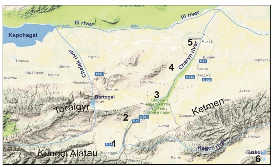
Figure 2. The scheme of geological sites of the Charyn river canyon

This history of sedimentation can be well read from the cuts on sides of the Charyn canyon within the Zhalanash depression. In the south part of the depression, the canyon sides (headstream) are composed of boulder and pebble. In the central and north parts of the Zhalanash depression, the sections' lower and middle parts are filled by lacustrine clays and marls, above they are intertwined with lenses and layers of sand-boulder-gravel deposits, and boulder gravels of the Pleistocene complete the section (Figure 2).