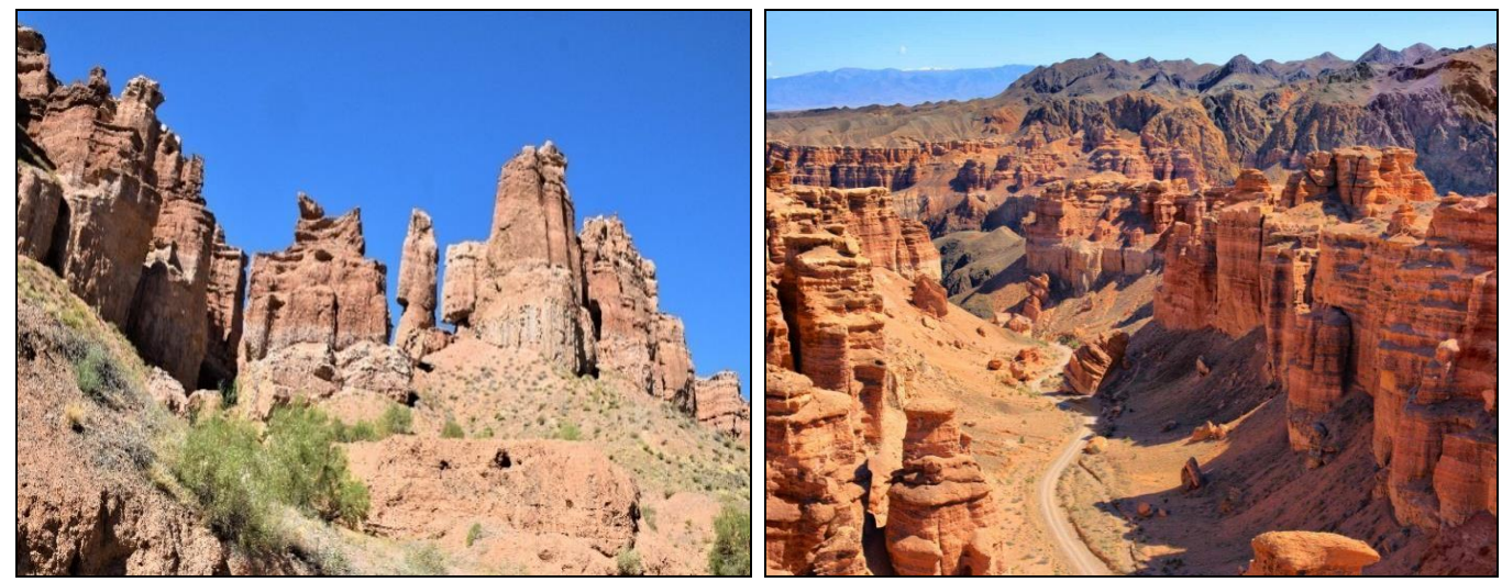
Figure 9. Charyn The "Valley of the Castles" of of Charyn canyons (zen.yandex, 2019)