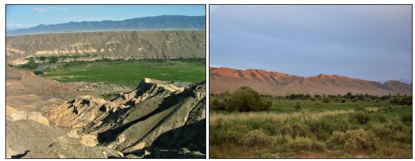
A. General view of The Kopaly (Aktogay) gorge