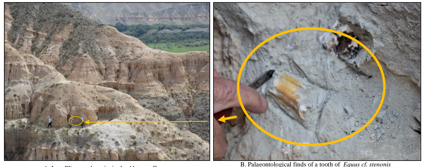
A. Late Pliocene deposits in the Aktogay Gorge Figure 6. Late Pliocene deposits in the Aktogay Gorge and palaeontological finds of a tooth of Equus cf. stenonis

man were found here dated 500-700 thousand BP. These are the oldest findings of its kind in the territory of Kazakhstan. The Paleozoic foundation uncovered by the Charyn River is represented by effusive carbonaceous rocks. They are opened on sides of the Zhalanash depression.