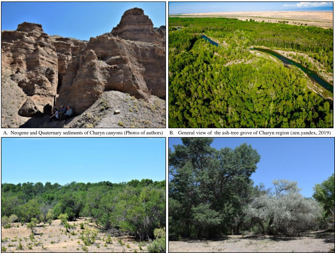
C. Sogdian ash trees Figure 11. The Sarytogai gorge and the Ash-tree grove of Charyn region

The river bed gets shallow. Down the Temirlik mouth, the Charyn canyon is called Sarytogai. It becomes wider and cuts into Neogene and Quaternary sediments to a depth of about 100 metres. The Sarytogai canyon is known for its relict ash-tree grove, which