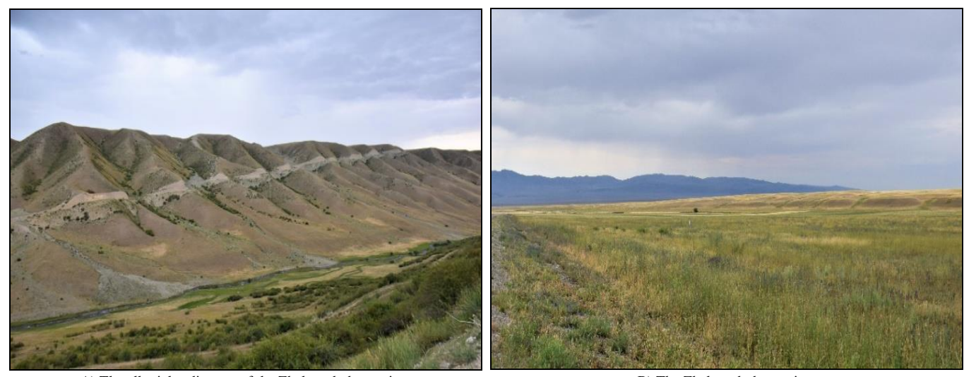
A) The alluvial sediments of the Zhalanash depression Figure 4. Scenic views of the Zhalanash depression

The main paleontological artefacts have been found in the Zhalanash depression. According to paleontologists, they are located in the section formations described from bottom to top as per deposition stages (Tyut'kova, 1988; Baybulatova et al., 1981; Kozhamkulova et al., 1987; Aubekerov et al., 1990; Jamangaraeva, 1993).