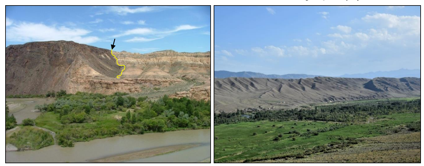
C. The contact of Paleozoic rocks with the Cenozoic loose-detrital stratum on the right side of the canyon